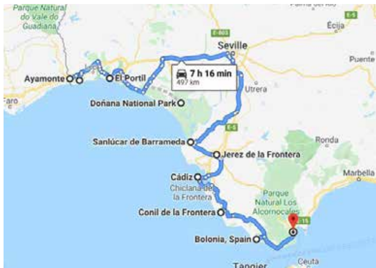
SPAIN: Ayamonte, Isla Cristina, El Portal, Huelva, Donana National Park, Sanlúcar de Barrameda, Jerez de la Frontera, Cadiz, Conil de la Frontera, Bolonia, Algeciras