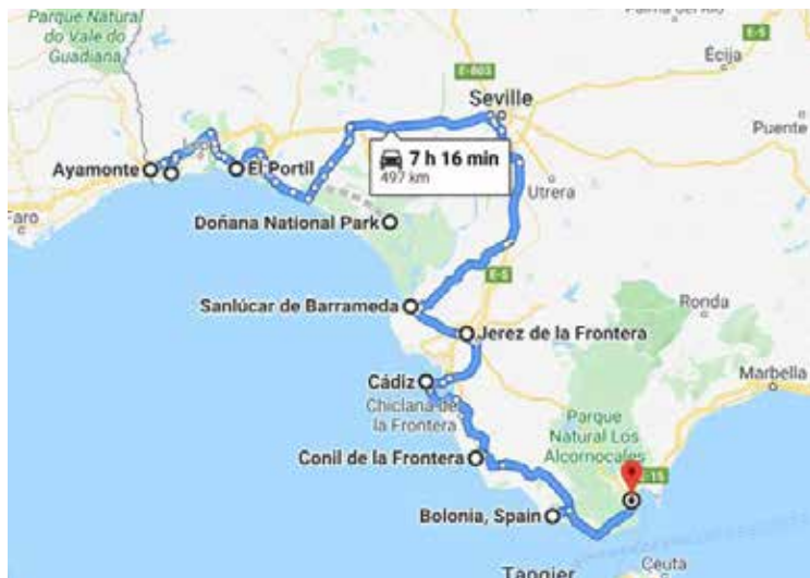
SPAIN: Ayamonte, Isla Cristina, El Portal, Huelva, Doñana National Park, Sanlúcar de Barrameda, Jerez de la Frontera, Cadiz, Conil de la Frontera, Bolonia, Algeiras