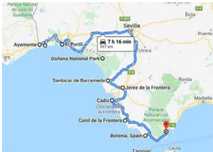
SPAIN: Ayamonte, Isla Cristina, El Portal, Huelva, Doñana National Park, Sanlúcar de Barrameda, Jerez de la Frontera, Cadiz, Conil de la Frontera, Bolonia, Algeciras